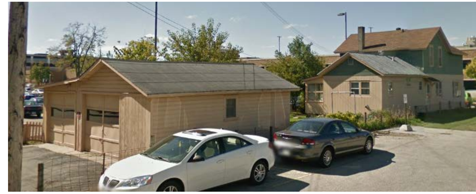
ALLEY VIEW SHOWING HOUSE & GARAGE