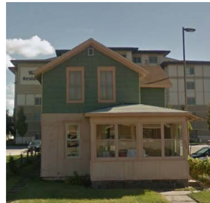
8TH STREET VIEW