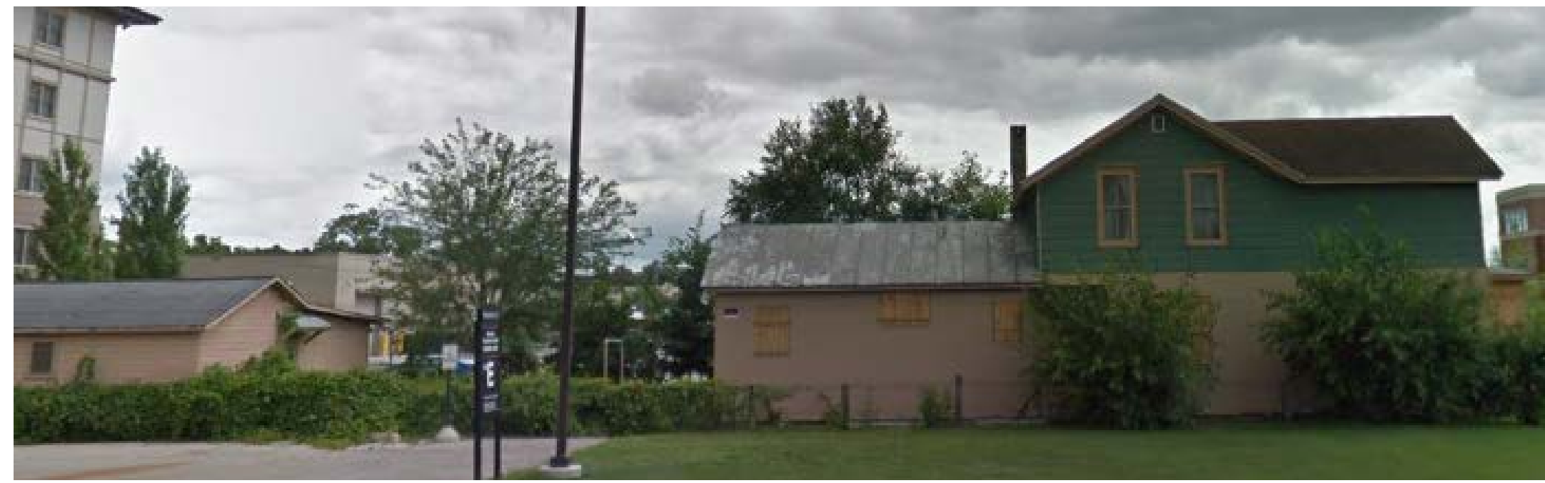
LA CROSSE STREET VIEW SHOWING HOUSE & GARAGE