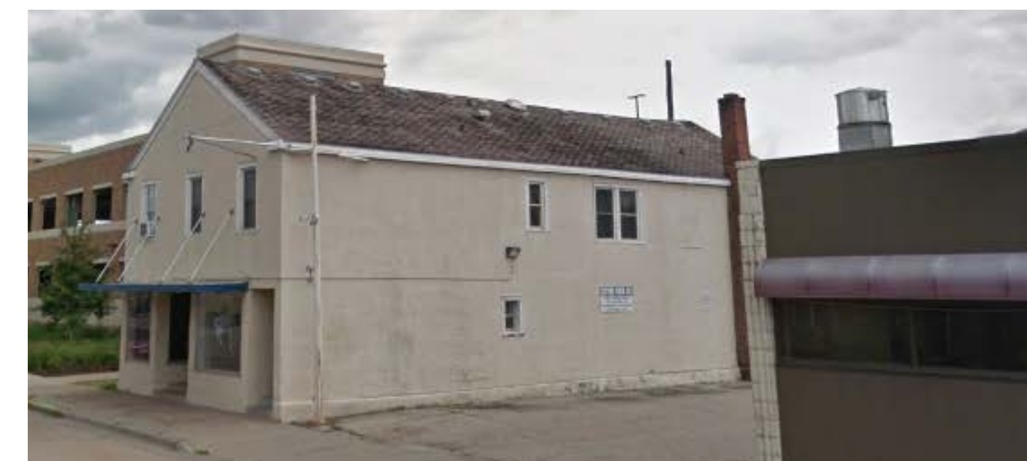
LA CROSSE STREET VIEWS